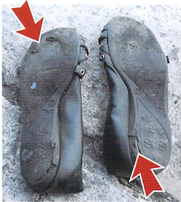
• Soles are too worn and not wearable