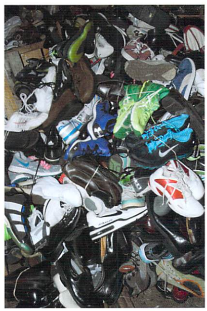
• Prior to bagging, all shoes in wearable, clean condition.