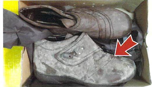
• Wet, moldy