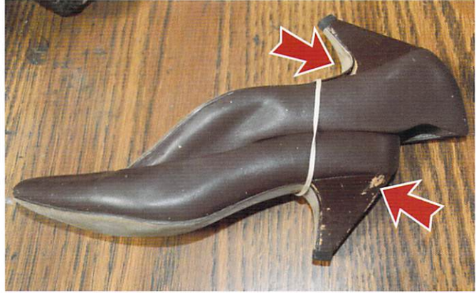
• Heel is broken and overall too worn to be usable