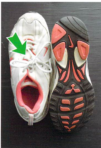
• Laces intact, lots of life left