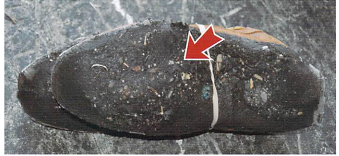
• Soles are melted, distorted and not wearable