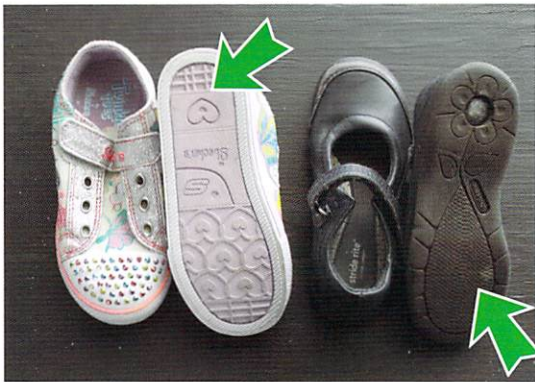
•Still wearable, clean, good condition