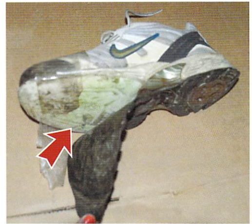
• Sole is falling off. Not in wearable condition.