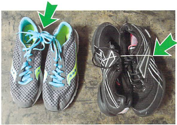
• Shoes are clean, good condition and bound either by tying the laces together or rubber bands.