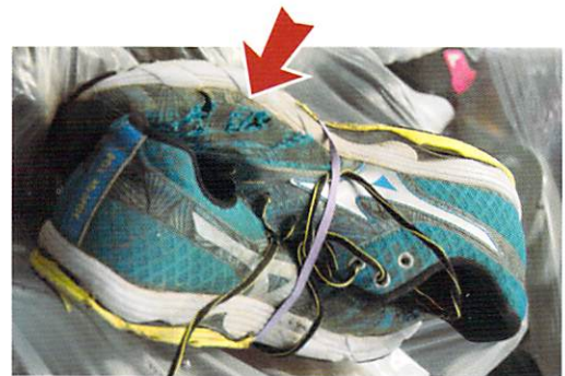
• Upper is worn through. Not in wearable condition.