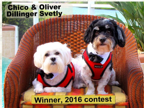
Winner, 2016 contest