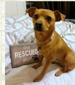
Stella Blue Wetton