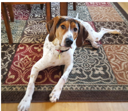
Kip relaxing in his foster home.

Foster homes: Foster homes make a big impact on the health and happiness of a homeless animal. This past year we've taken big strides to encourage more volunteer foster homes and increase the number of pets in foster care. We've also had a number of wonderful 'foster failures' where some of our foster homes adopted their foster pet! From June 2014 to December 2015 over 340 pets were adopted from the comforts of their foster homes!