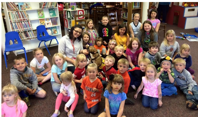
R.U.F.U.S Dog Safety Class for Youth put on by UPAWS.

New to UPAWS: We're taking social media to the next level! New to UPAWS is Sponsored Facebook Ads. Donors are able to help UPAWS pay for these sponsored ads which helps our Facebook posts reach a large number of people (example, a sponsored ad can reach an additional 10,000 people!).