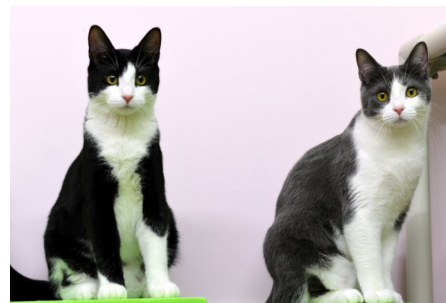
Two brother kitties hang out at UPAWS after being transferred from another shelter. Shortly after they were adopted together!

Networking with other shelters: During the previous year we've been striving to build a stronger relationship with our neighboring shelters in Michigan. We recognize the power of teamwork and strength in numbers. We also strongly believe Michigan is capable of becoming a No-Kill state and we want to play a role in making that happening. Together with other Michigan shelters we are transferring pets to places with potential adopters, networking to get pets adopted and moving pets out of high kill shelters.