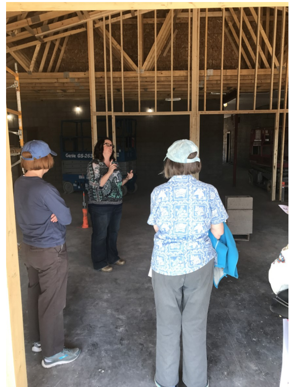
Contact Kori for a tour of the new shelter construction progress!